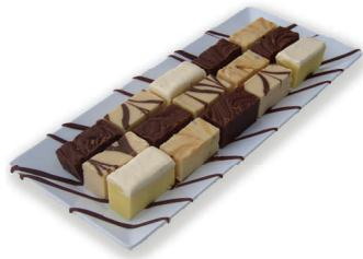
Sweet Corner fudge made on the premises at Victoria Point

Planning your wedding can be the most wonderful, but stressful time of your life. We here at Sweet Corner would like to make your special day